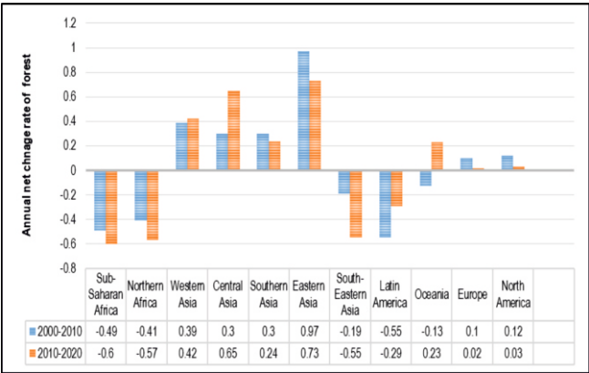
Fig. 1: In Sub-Saharan Africa, forest cover shrank at a faster rate between 2010 and 2020 than between 2000 and 2010.

Forest cover decreased from 31.9% of the total land area in 2000 to 31.2% in 2020, representing a net loss of nearly 100 Mha. The global forest cover is continuing to decline, with significant losses occurring in Latin America and Sub-Saharan Africa. The data in Fig. 1 depict the annual net change rate in forest area from 2000 to 2010 and 2010 to 2020. The annual net change in forested area as a percentage of total forest area is measured by the forest area net change rate. Negative values represent a net loss of forest while positive values represent a net gain (UN, 2022a).